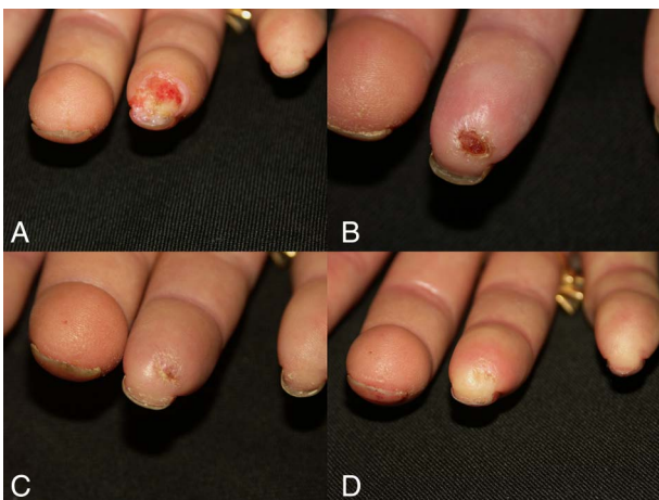
Figure 3 Example of digital ulcer evolution during the clinical trial in a patient who was assigned to the sildenafil group. (A) at randomisation; (B) at week 4; (C) at week 8; and (D) at week 12.