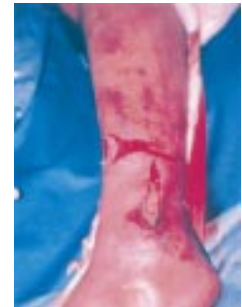
See p 848