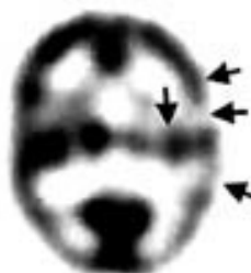
See p 774