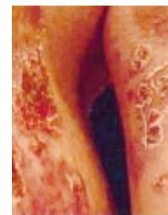
See p 850