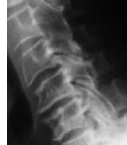
See p 650