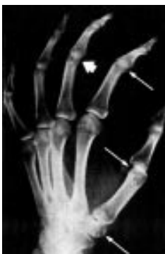
See p 895